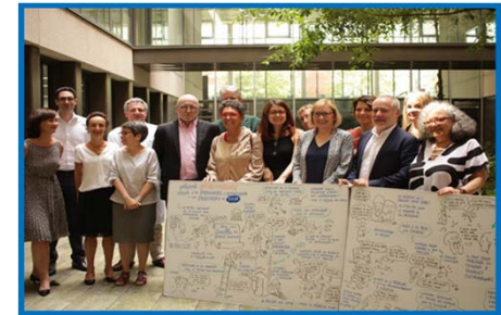
May 2018 - Paris, France