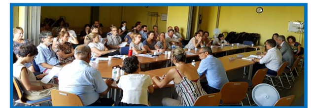
July 2019 - Bordeaux, France