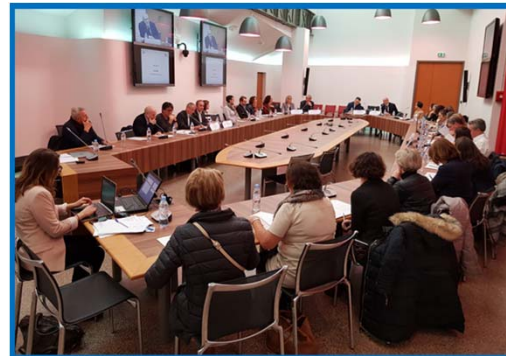
February 2019 - Lyon, France