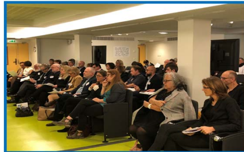
October 2018 - Paris, France